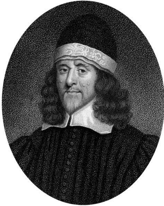
Thomas Goodwin (1600-1679)