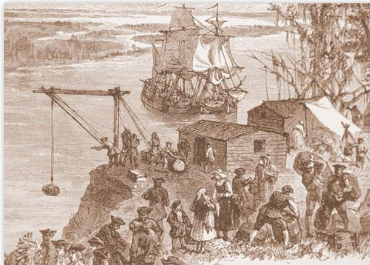
Collection of Ed Jackson