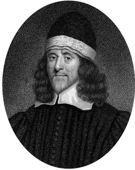
Thomas Goodwin (1600-1679)

When a ship comes home, not only the chief owners, but everyone that ventured shall have a share out of the return, in a proportion to the adventure.